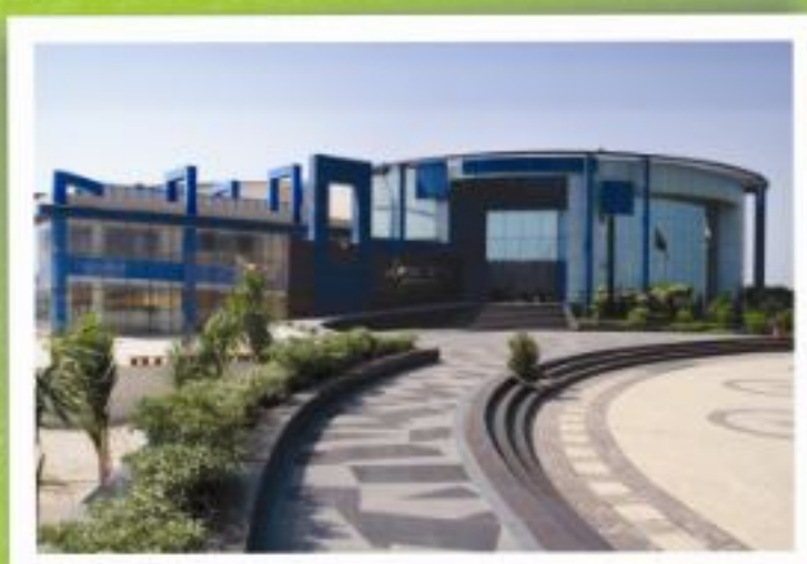
LOTUS VALLEY INTERNATIONAL SCHOOL, NOIDA