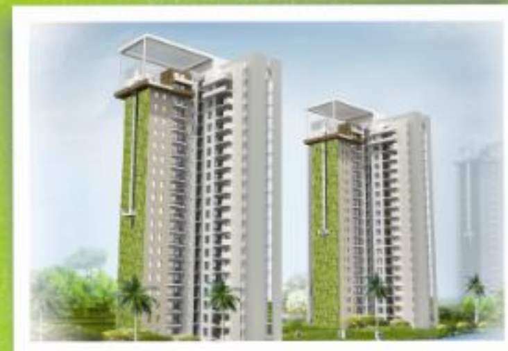
LOTUS PANACHE, NOIDA