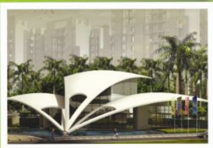
LOTUS BOULEVARD, NOIDA