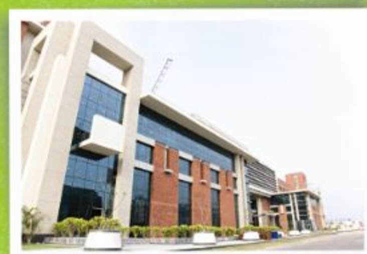
CSC CAMPUS, NOIDA