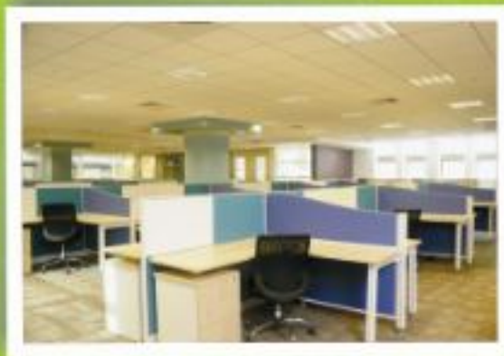
SPECTRAL SERVICES, HYDERABAD GOLD RATED LEED CERTIFIED GREEN BUILDING - 2009