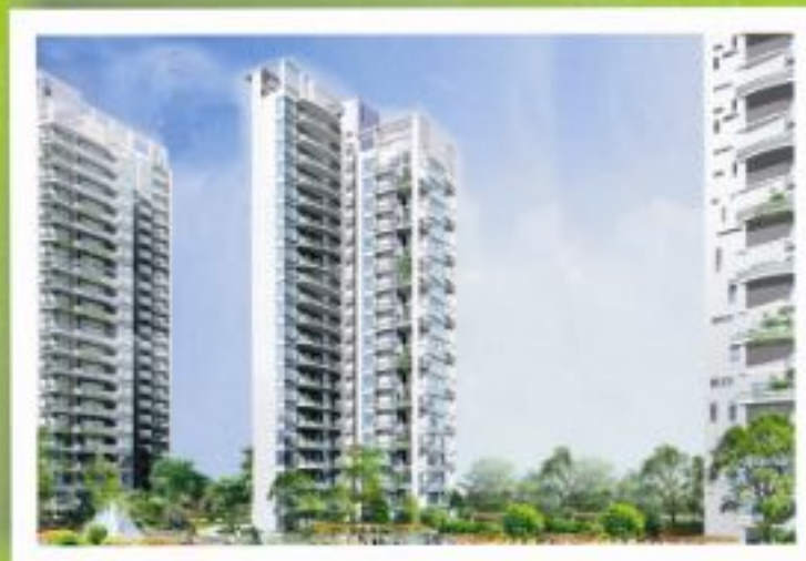
LOTUS BOULEVARD ESPACIA, NOIDA