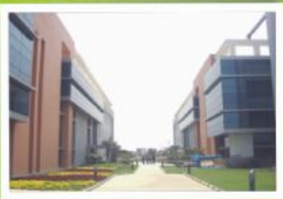
WIPRO TECHNOLOGIES, GREATER NOIDA GOLD RATED LEED CERTIFIED GREEN BUILDING - 2009