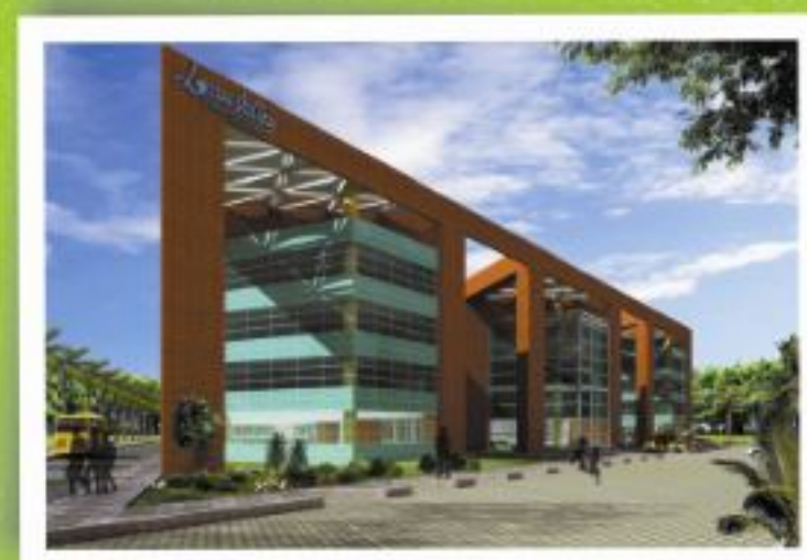
LOTUS VALLEY INTERNATIONAL SCHOOL, GURGAON

Note: Buildings get LEED rating only after they are operational.