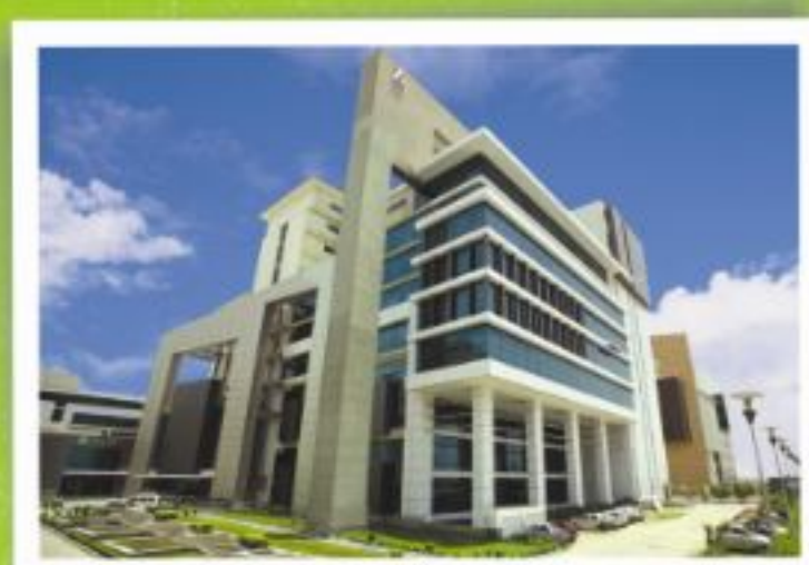
TECH BOULEVARD, NOIDA