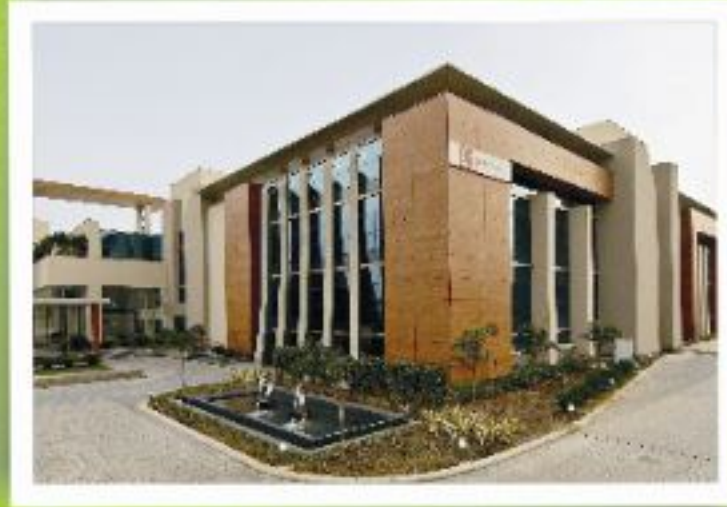
PATNI KNOWLEDGE CENTRE, NOIDA (BLOCK A) PLATINUM RATED LEED CERTIFIED GREEN BUILDING - 2008