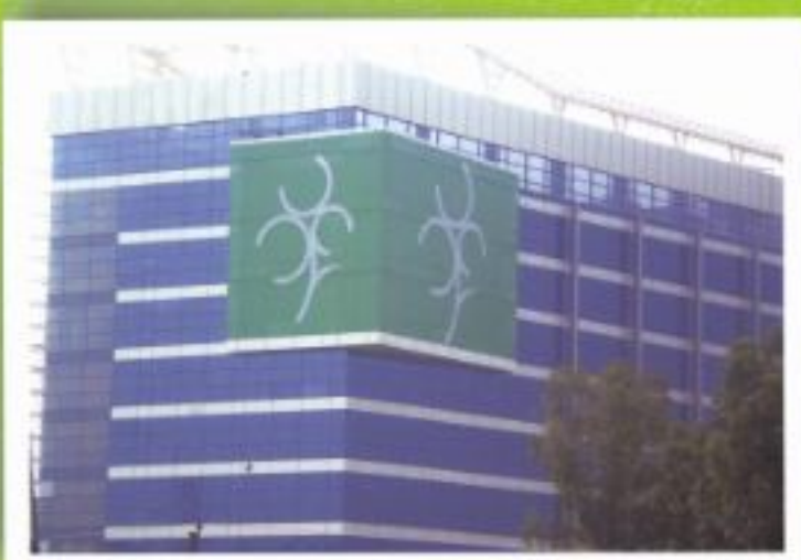
KNOWLEDGE BOULEVARD, NOIDA