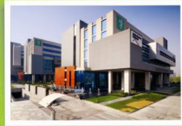
GREEN BOULEVARD, NOIDA PLATINUM RATED LEED CERTIFIED GREEN BUILDING - 2009