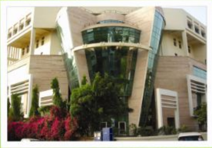
WIPRO TECHNOLOGIES, GURGAON PLATINUM RATED LEED CERTIFIED GREEN BUILDING - 2005