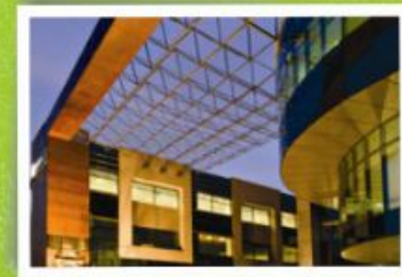
PATNI KNOWLEDGE CENTER, NOIDA (BLOCK B) GOLD RATED LEED CERTIFIED GREEN BUILDING - 2011