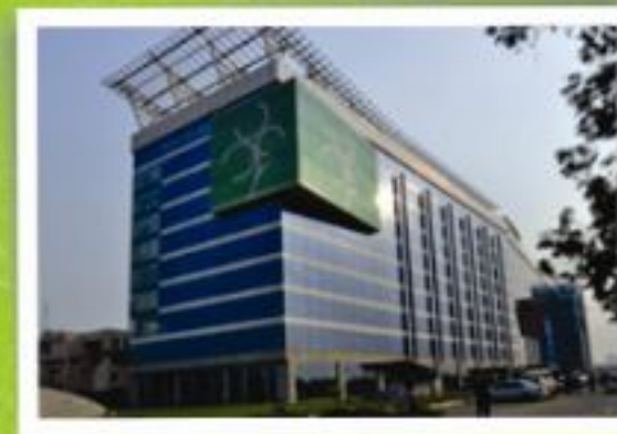
KNOWLEDGE BOULEVARD, NOIDA GOLD RATED LEED CERTIFIED GREEN BUILDING - 2011